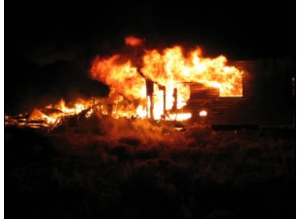
Fire destroyed an apparently unoccupied mobile home two miles north of the town of Blanca on Sunday.

No one was reported as injured by the fire, but the structure was burned to the ground.