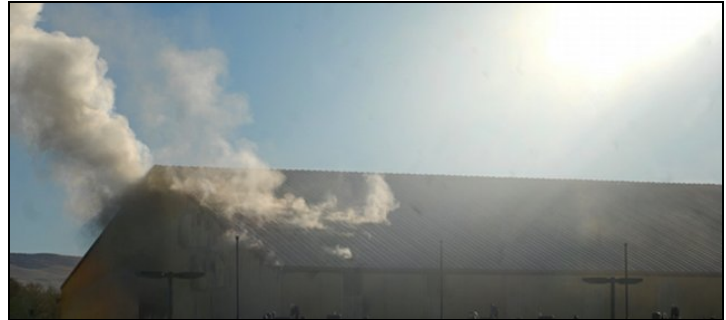
Smoke billowed out of the northeast side of the Road and Bridge Department's County Shop on Saturday afternoon.