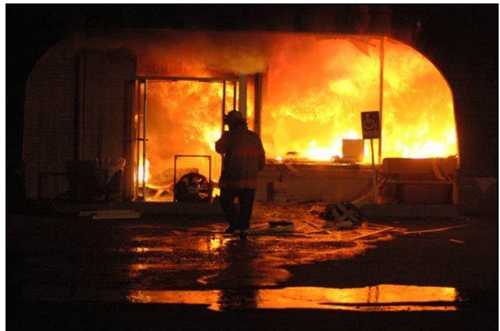
A firefighter is silhouetted against a fire that gutted a professional office complex in Craig on Nov. 26, 2007.

At around 1 a.m., firefighters temporarily backed away from the fire to let the east side of the building burn out. Firefighters on scene said the fire was largely burned out by 4 a.m. The fire rekindled off and on throughout Monday. Firefighters are expected to clear the scene Monday evening, with Craig Police Department officers monitoring for fires overnight.