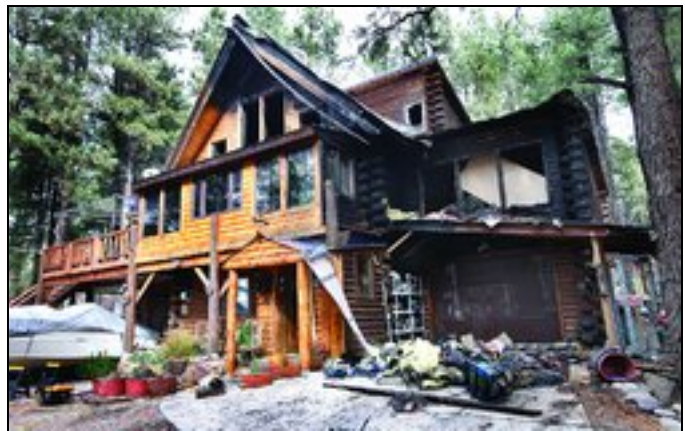
A Forest Lakes home north of Bayfield was partially destroyed during a fire Monday night.

A heat lamp used for a turtle's aquarium is believed to have sparked the blaze, but the exact cause remained under investigation Tuesday.