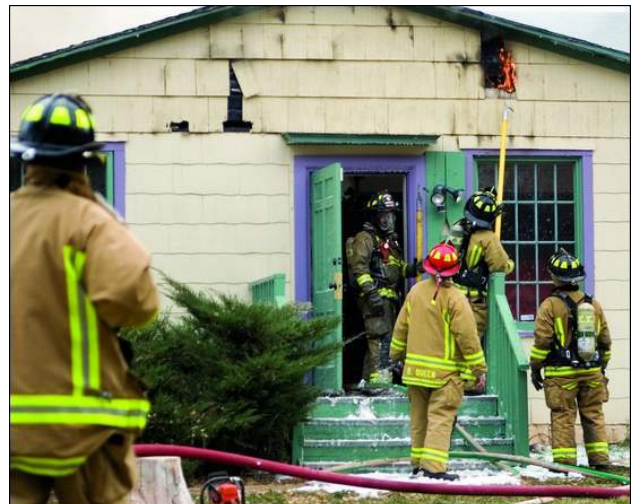
Glenwood firefighters work on a building fire along South Grand Avenue Friday morning. Bishop Plumbing & Heating moved into the building less than a month ago.