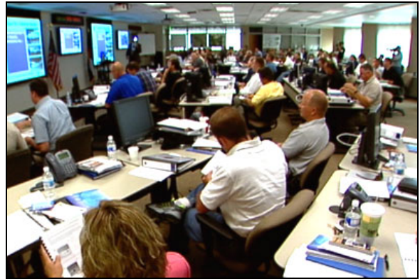
State Emergency Operations Center in Centennial.

"These computers are designed to provide protection to the people in Colorado in times of very serious need," said State Rep. Cory Gardner, (R-Dist. 63). "They're not there to provide entertainment to state employees and certainly not there to download illicit images."