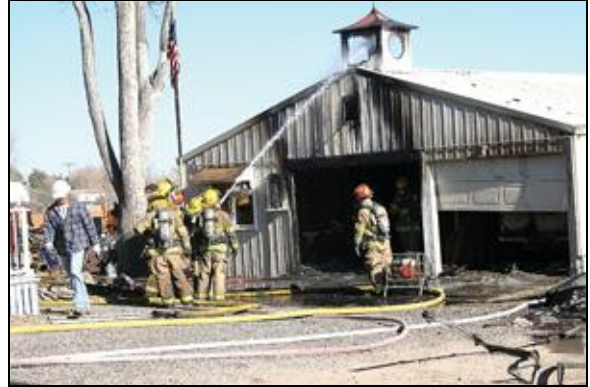
Fire fighters extinguish what is left of a garage fire on Logan County Road 37 near County Road 30 on Saturday.

The cause of the fire is still under investigation.