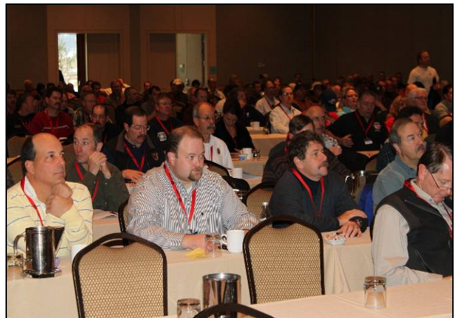
Participants in the opening session of the 2010 FLC