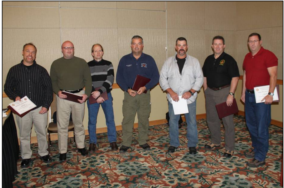
Some of the 2010 Graduates of the Company Officer Leadership Symposium at the completion of their third and final level of training in Keystone, CO.